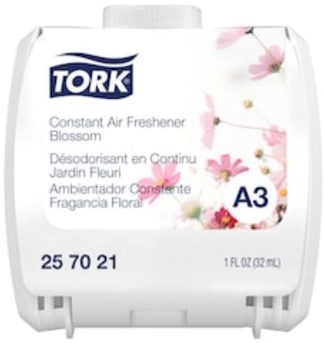
A3 REFILL BLOSSOM 6/1 CASE 257021