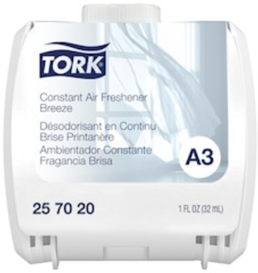
A3 REFILL BREEZE 6/1 CASE 257020