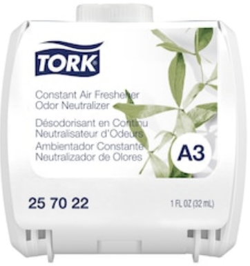
A3 REFILL OD NEUT 6/1 CASE 257022